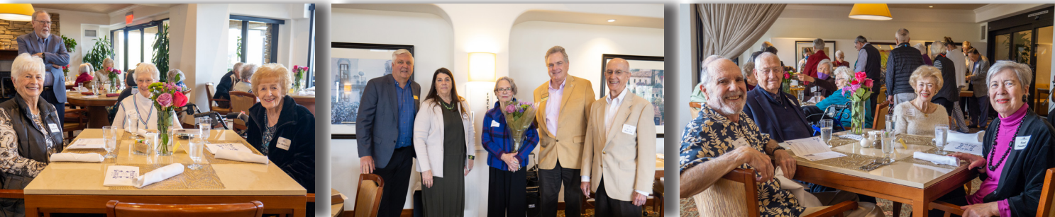
Legacy Luncheon 2023

The Legacy Society honors and acknowledges all donors who have made deferred and/or gifts totaling $15,000 or more to the Casa Foundation. Legacy gifts have been instrumental in creating many visible benefits for Casa residents and continue to serve as an example of philanthropy at work. The Legacy Society currently acknowledges 93 members.