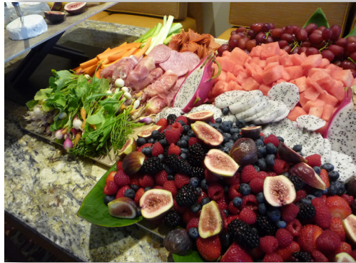
Legacy Cocktail Reception 2018

The Legacy Society, which honors and acknowledges all donors who have made deferred and/or outright gifts totaling $15,000 or more to the Casa Foundation, has been a significant factor in the Casa Foundation's growth and success. Legacy gifts have been instrumental in creating many visible benefits for Casa residents and continue to serve as an example of philanthropy at work. Originally consisting of several benefactors, the Legacy Society now acknowledges a total of 263 memberships (96 living).